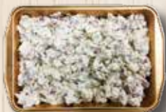
Red Skin Potato Salad Tray