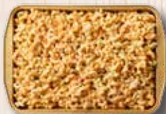
Creamy Mac and Cheese Tray