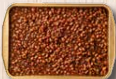
Signature BBQ Baked Beans Tray