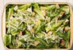
Caesar Salad Tray